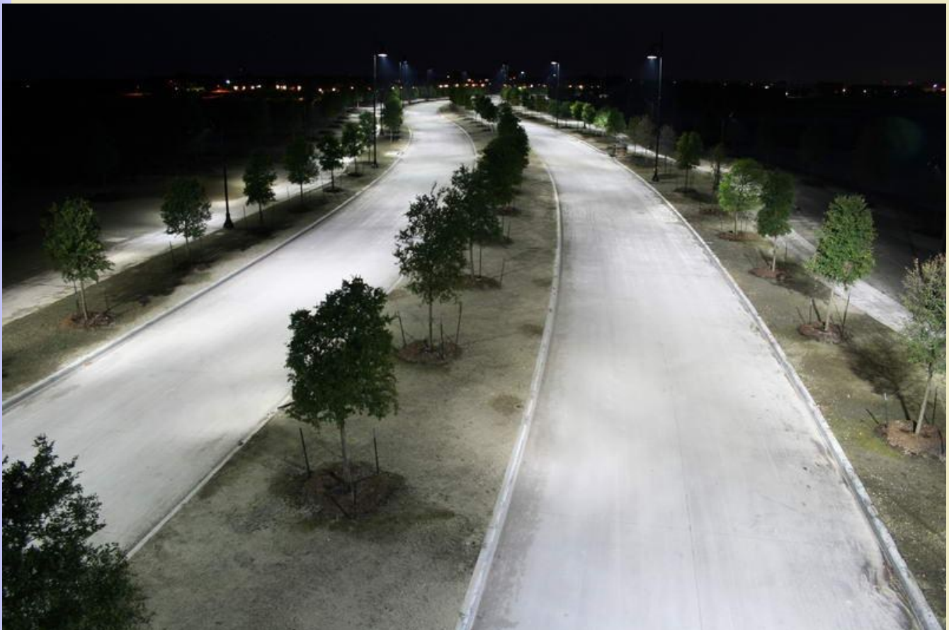
EvoLucia LED Streetlights on Fairview Parkway

We're on the web! Check us out! www.fairviewtexas.org